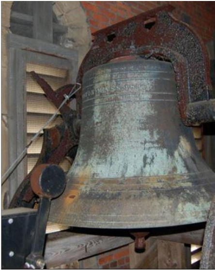
The Paul Revere bell was recast after the fire of 1892. The bell still rings daily, using an automated ringer.

The General Society of Mayflower Descendants has taken on the challenge of raising funds to buy and to refurbish the historic First Parish Meetinghouse also known as The National Memorial Pilgrim Church. The General Society is asking each state society – including ours -- to participate in fundraising for this project over the next three years. Our goal is $5,000. This series of articles tells the story behind this building and, we hope, inspires you to consider donations to the project. You can buy a pin or make a direct donation at the GSMD's website, themayflowersociety.org ; look under the DONATE tab for Meetinghouse