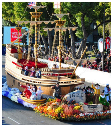
The Mayflower Float in 2020 Rose Bowl Parade