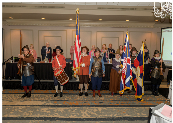
Start of the Board Of Assistants Meeting