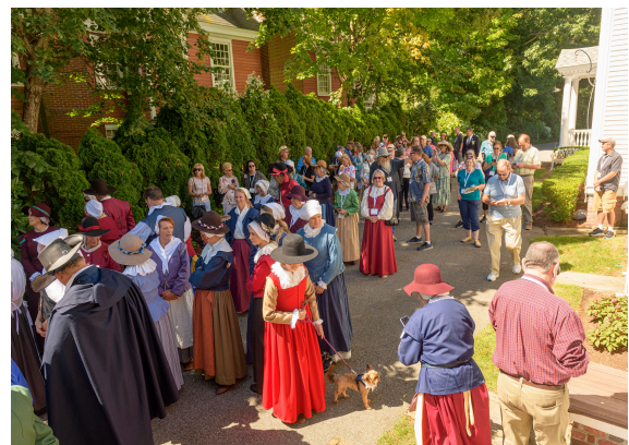
Pilgrims gathering for Pilgrim Progress