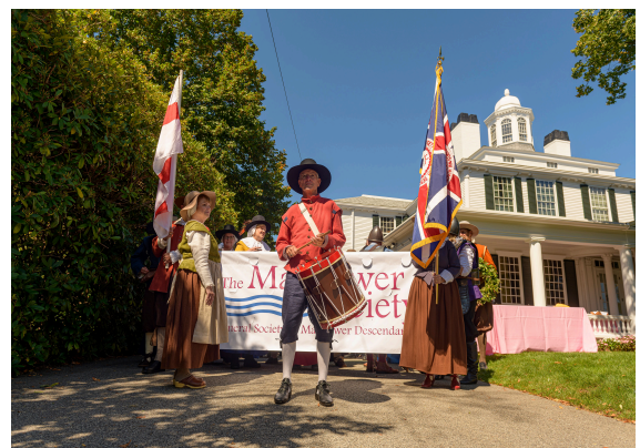
Pilgrim Progress at Mayflower Society House