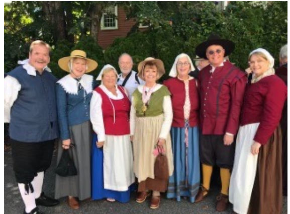
NSMD Attendees with Governor General Hunt