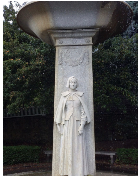
The Pilgrim Mother statue in Plymouth, MA, built in 1921 for the tercentenary of the voyage of Mayflower (by the DAR)